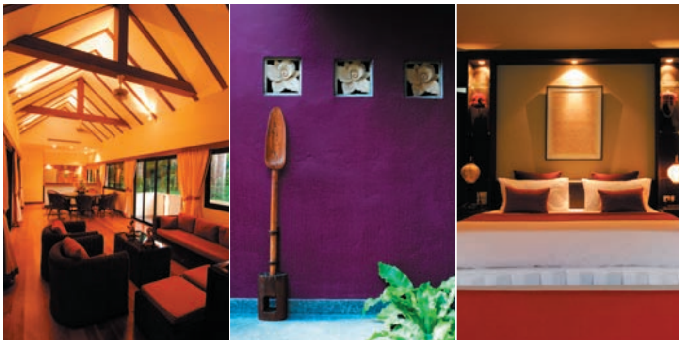
Family-friendly, facility-rich seclusion at Ban Kao on Koh Samui